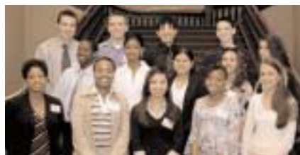
YCI members at 2005 Annual Meeting.

Now in its fifth year, YCI has engaged over 75 high-school students in grantmaking and leadership development. In 2005, YCI distributed $30,000 to ten nonprofit organizations.